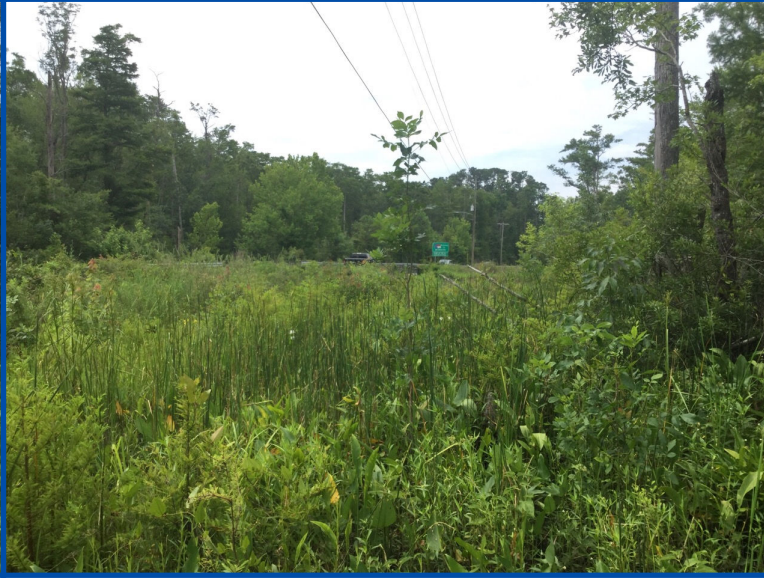
4 - Site View